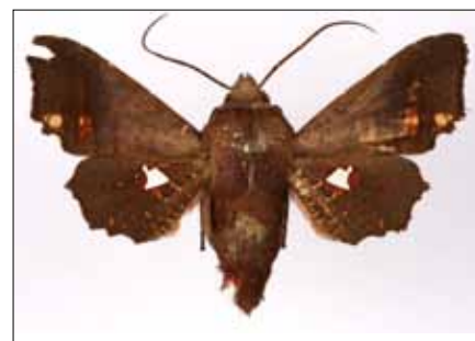
Thyrididae: Thyridinae, Unnamed Dysodia sp. from Sabah (Kampung Poring). Possibly a var. of D. fenestrata (Moore, 1881)