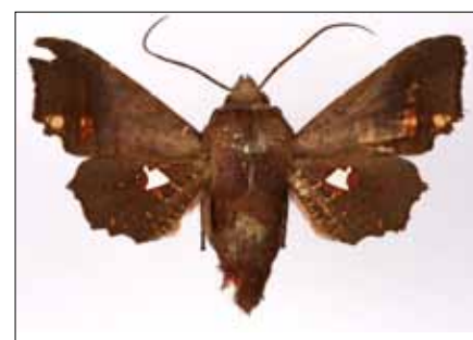
Thyrididae: Thyridinae, Unnamed Dysodia sp. from Sabah (Kampung Poring). Possibly a var. of D. fenestrata (Moore, 1881)