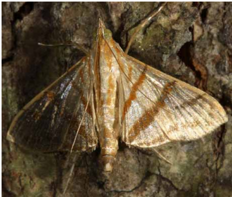
Crambidae: Pyraustinae, Pagyda botyidalis (Snellen, 1880) from Sabah (Danum Valley)