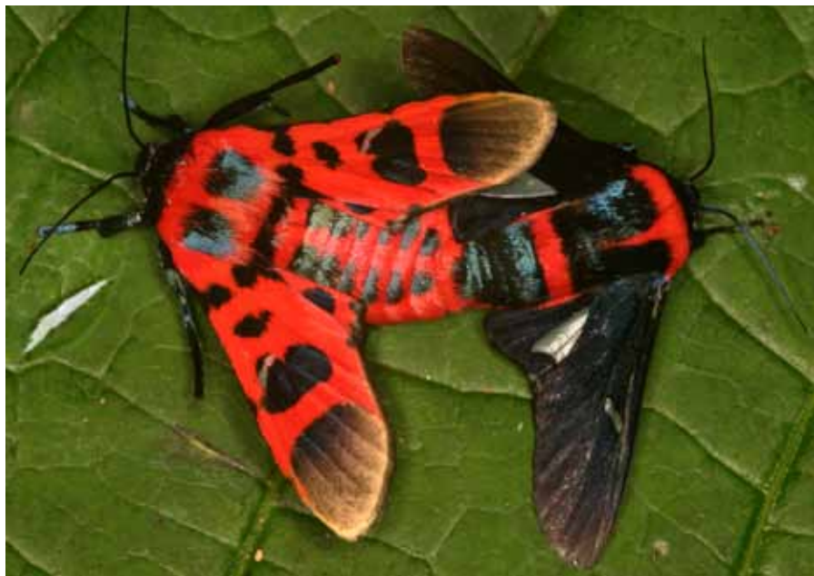
Thyrididae: Thyridinae. ♀ Glanycus tricolor Moore, 1879 and ♂ G. insolitus Walker, 1854 from Thailand, Chiang Mai